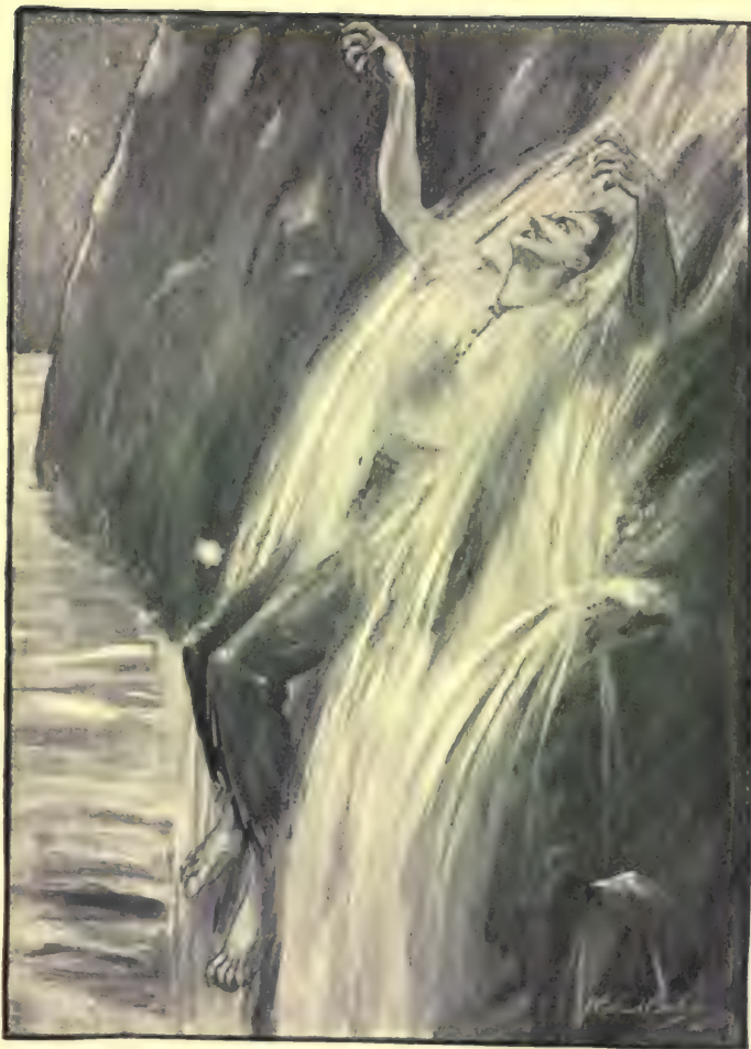
SO THEY GLIDE OUT INTO SPACE AND DROP TWO HUNDRED FEET INTO THE BALTIC.— Page 185